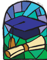
Baccalaureate WORSHIP SERVICE