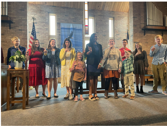
Bloomington Youth Group