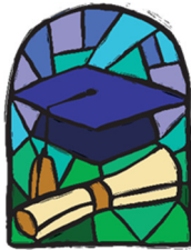
Baccalaureate WORSHIP SERVICE

Baccalaureate Wed May 22nd at 7pm COS & St. Anthony's will host Baccalaureate for the 2024 Mackinaw City Graduates on Wednesday, May 22nd at 7:00 pm. All are welcome to attend. If you would like to bring a plate of finger food or cookies, a reception will follow the service.