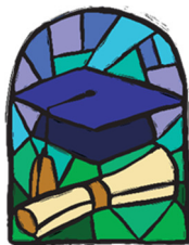
Baccalaureate WORSHIP SERVICE

COS & St. Anthony's will host Baccalaureate for the 2024 Mackinaw City Graduates on Wednesday, May 22nd at 7:00 pm. All are welcome to attend. If you would like to bring a plate of finger food or cookies, a reception will follow the service.