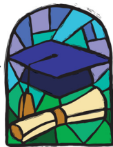
Baccalaureate WORSHIP SERVICE