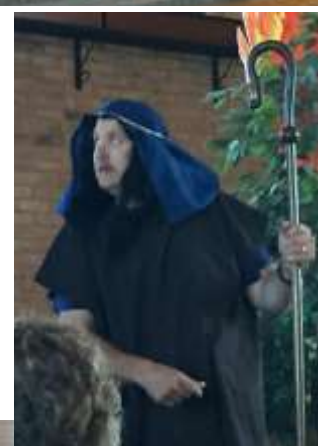
Pharaoh and Moses!