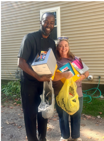
School Supplies for Kids in Jamaca