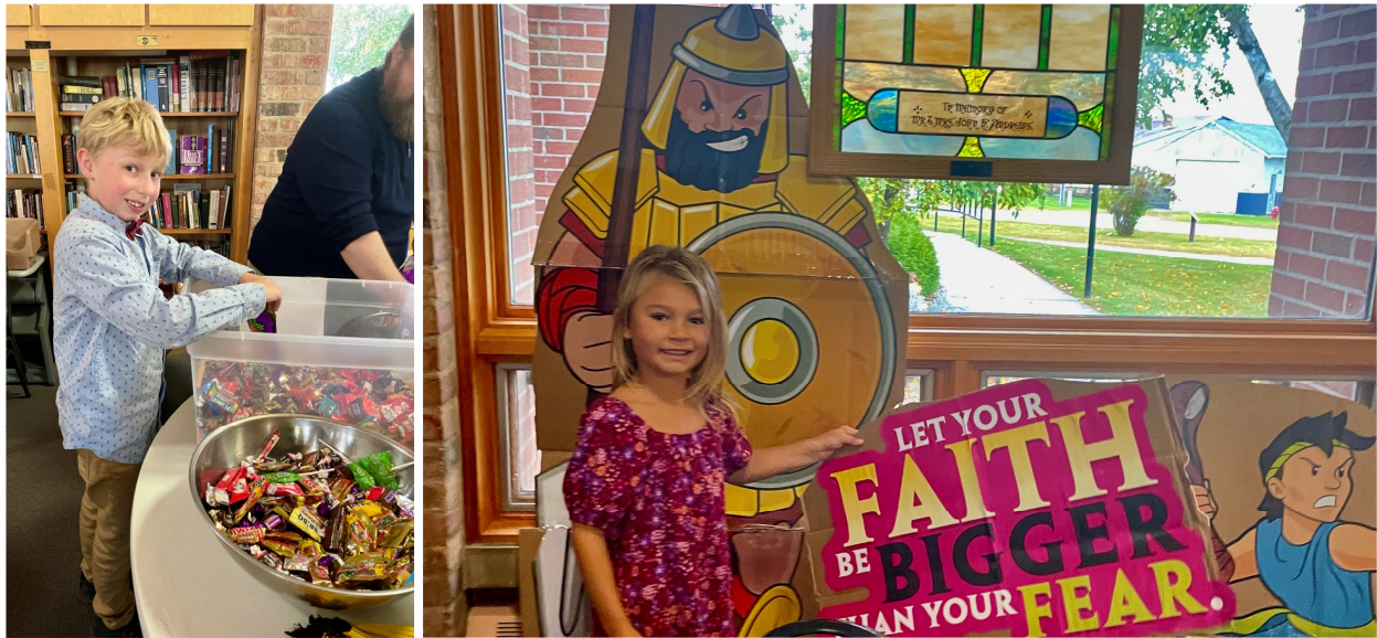
Getting Ready for Trunk or Treat

We will have collection boxes for any items that are donated. Thanks for your support helping us to make a “Change” in our community.