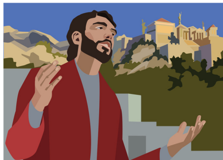
Paul Preaches in Athens

..... Please join us for refreshments after the service in the Fellowship Hall. Everyone is welcome!