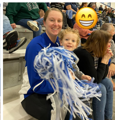
Cheer for the home team!