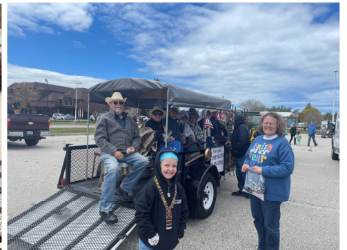
Memorial Day Parade