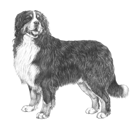
Fun Fact Berners can haul up to 1,000 pounds 10 times their weight!