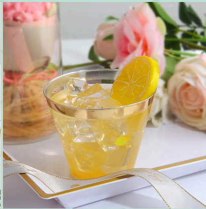
WINE 9 OZ