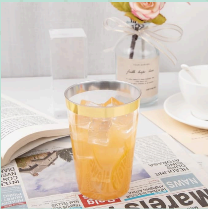
COCKTAIL 12 OZ