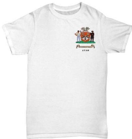
T-shirt with family crest

THESE ITEMS MUST BE PICKED UP AT THE FAMILY REUNION. THEY WILL NOT BE SHIPPED.