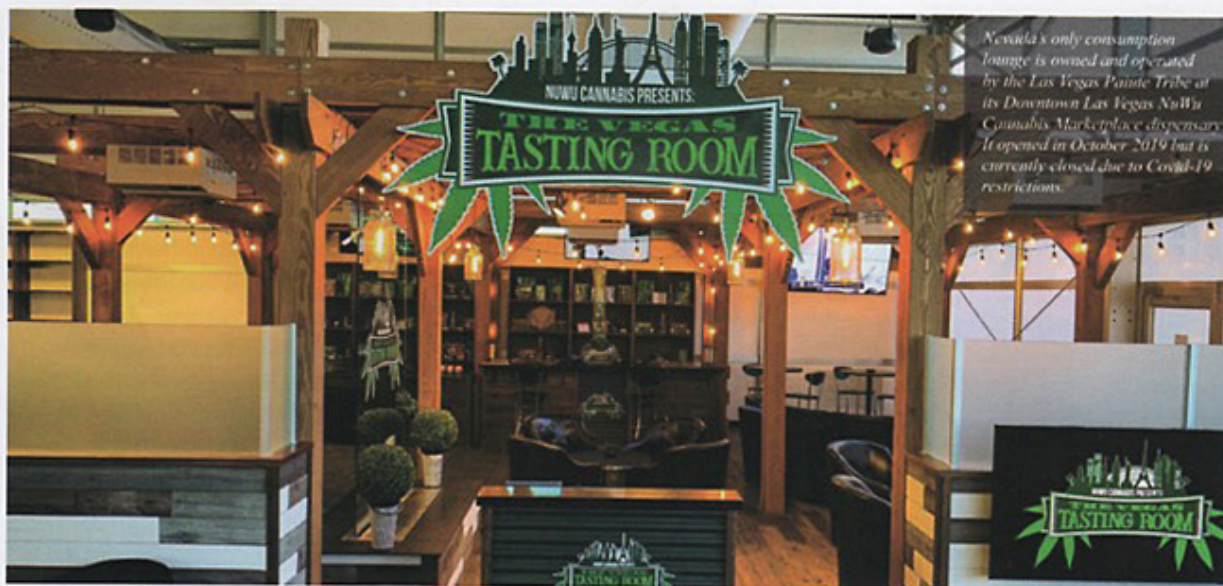
Nevada's only consumption lounge is owned and operated by the Las Vegas Paiute Tribe at its Downtown Las Vegas NuWu Cannabis Marketplace dispensary. It opened in October 2019 but is currently closed due to Covid-19 restrictions.