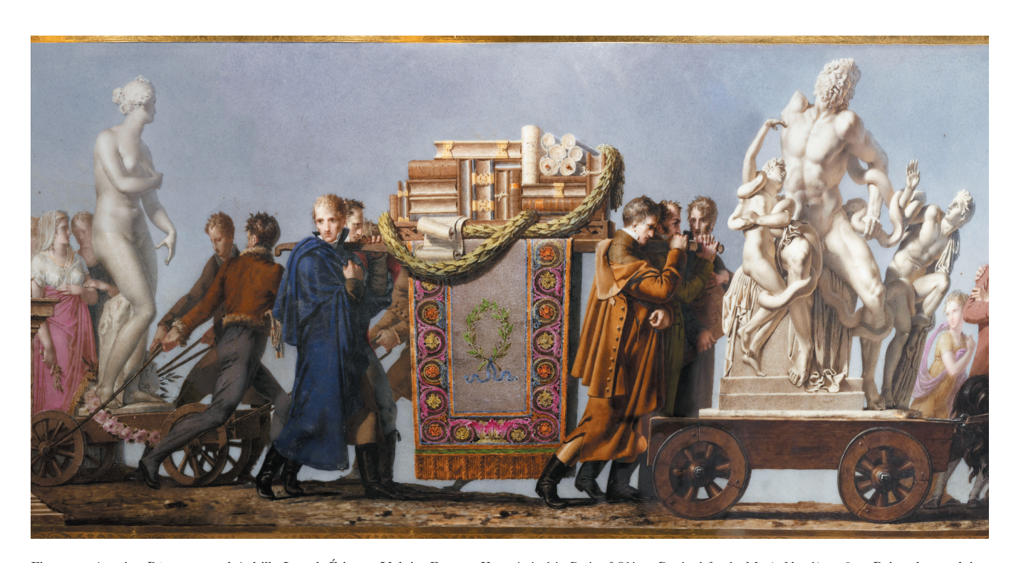
Figure 3. Antoine Béranger and Achille-Joseph-Étienne Valois, Etruscan Vase: Arrival in Paris of Objects Destined for the Musée Napoléon, 1813. Painted porcelain. Cité de la céramique, Sèvres.

The reception of these confiscated works, which was widely covered in mainstream French newspapers, was commemorated in a series of prints and artworks. Between 1811 and 1814, a Sèvres porcelain service was also produced to mark the occasion, including a large vase encircled with a depiction of the procession (figure 3). The vase's clever decoration plays on the sheer novelty of bringing together large-scale statues from different locations and especially the 'animation' or movement of that which was formerly immobile. Books and manuscripts, piled atop one another, affirm the scholarly status of the undertaking; Napoleonic France is portrayed as a great repository for the world's knowledge as well as its masterpieces. But