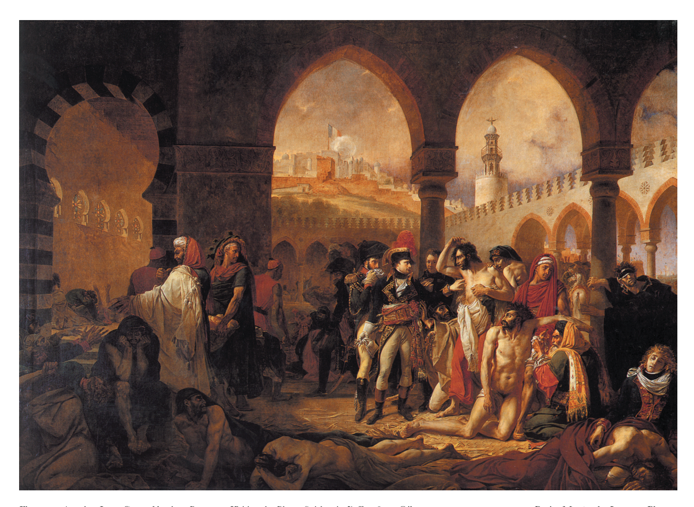
Figure 1. Antoine-Jean Gros, Napoleon Bonaparte Visiting the Plague-Stricken in Jaffa, 1804. Oil on canvas. 715 × 523 cm. Paris, Musée du Louvre, Photo: Wikimedia Commons.

In what follows I will indicate just a few of the many ways in which we might trace this broader phenomenon, looking first at the ascendance of history as a popular genre or medium, then at the literal means by which historical signifiers were collected during Napoleon's military campaigns and subsequently disseminated textually and pictorially, before returning, at the end, to Gros. Doing so allows us to see several seemingly different practices and strategies as interlocking rather than parallel phenomena. An essentially cumulative form of historical meaning emerges that can be traced across a range of locations and modalities in Napoleonic France.