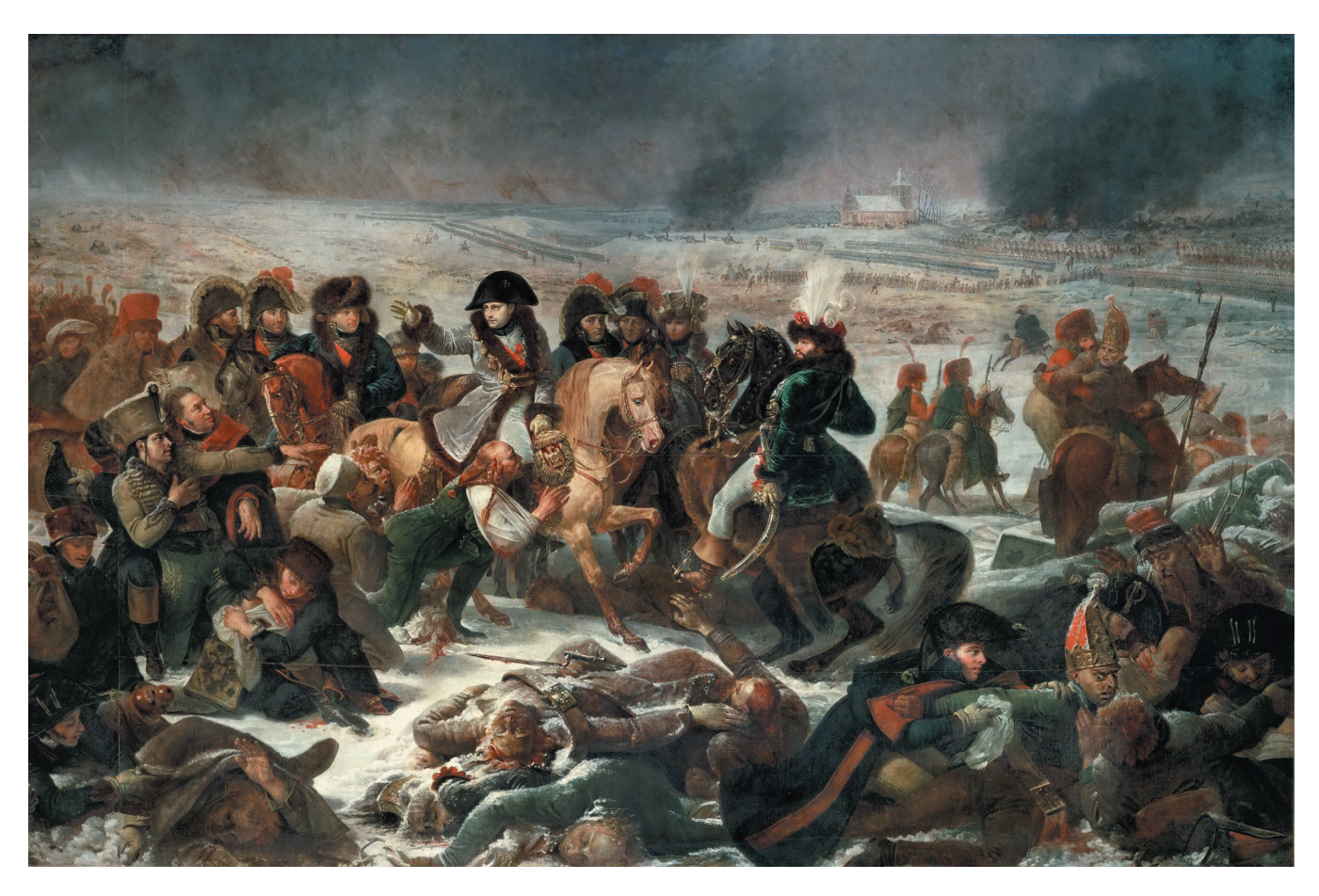
Figure 5. Antoine-Jean Gros, Napoleon on the Battlefield of Eylau, 1808. Oil on canvas. 521 × 784 cm. Paris, Musée du Louvre, Photo: Wikimedia Commons.

The text itself contained observations, studies, numerical charts, and historical accounts by dozens of authors, many of whom were uncredited. Although these texts were grouped by subject —bird species, for example, or agriculture—there is little in the way of narrative transition between different kinds of information, different authors, and differently organized texts. The book could not make use of the chronological structure found in Denon's account, for volumes were published according to the order in which they were completed—consequently, it was not uncommon for two volumes on the same topic to be published up to a decade apart. Nor could Description revert to the kind of unifying stylistic, editorial, or philosophical framework on which the great encyclopaedias and atlases of the eighteenth century relied.