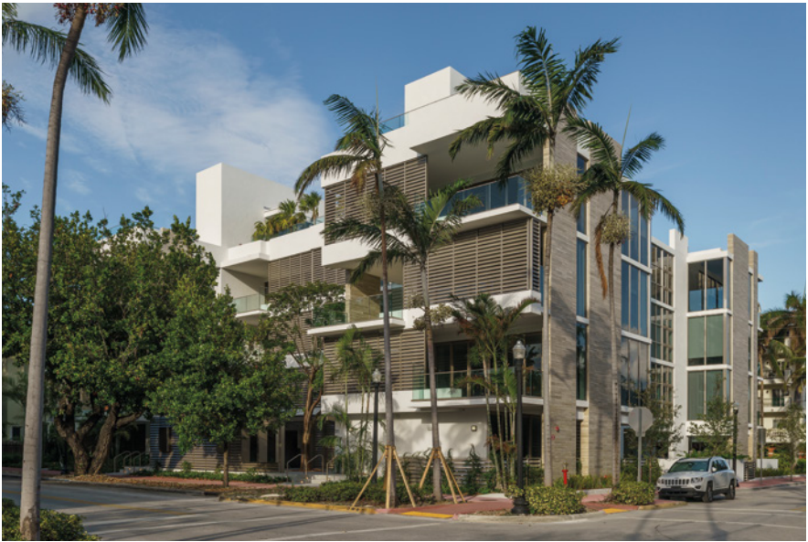
Louver House, Miami USA