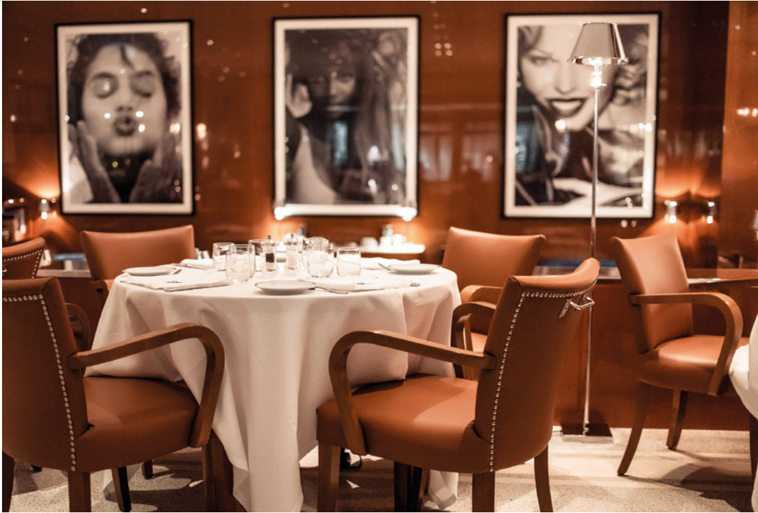
Cipriani Dubai, United Arab Emirates