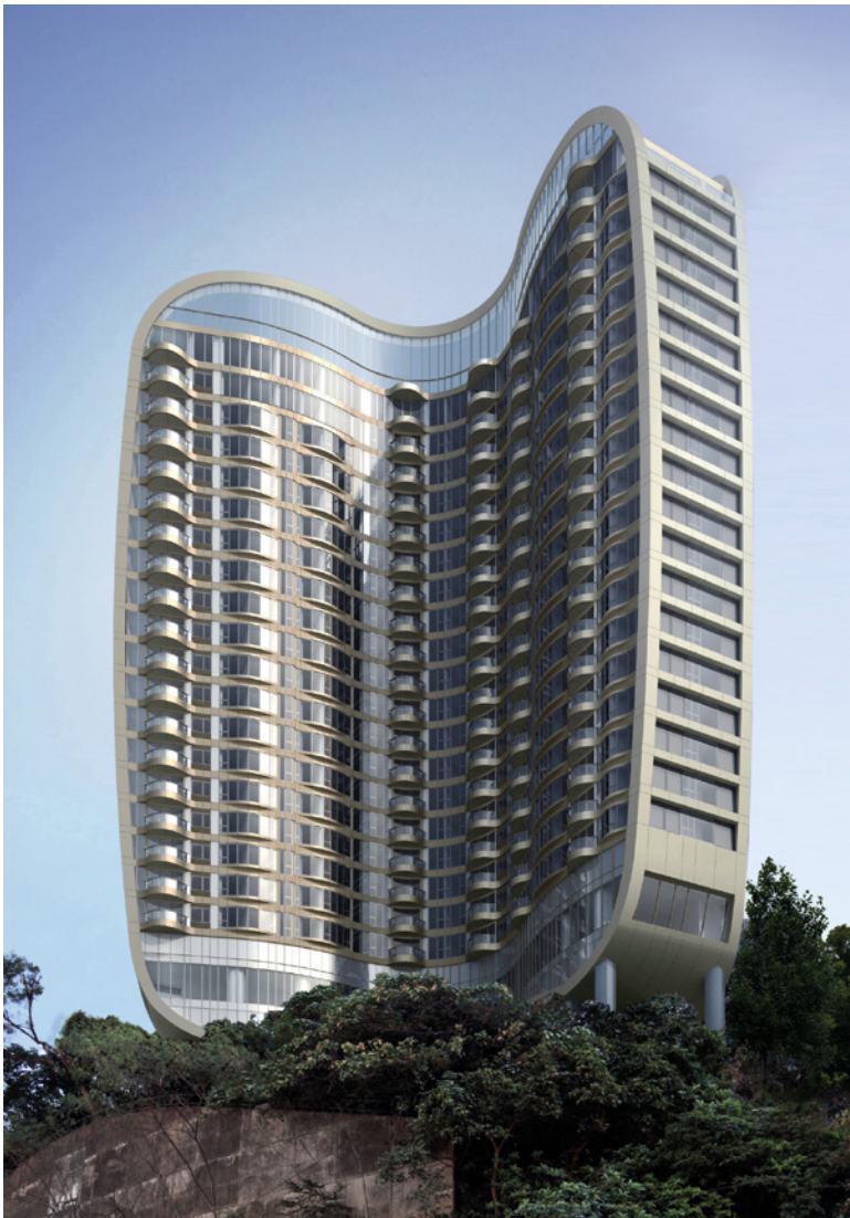
Mount Parker Residences, Hong Kong China