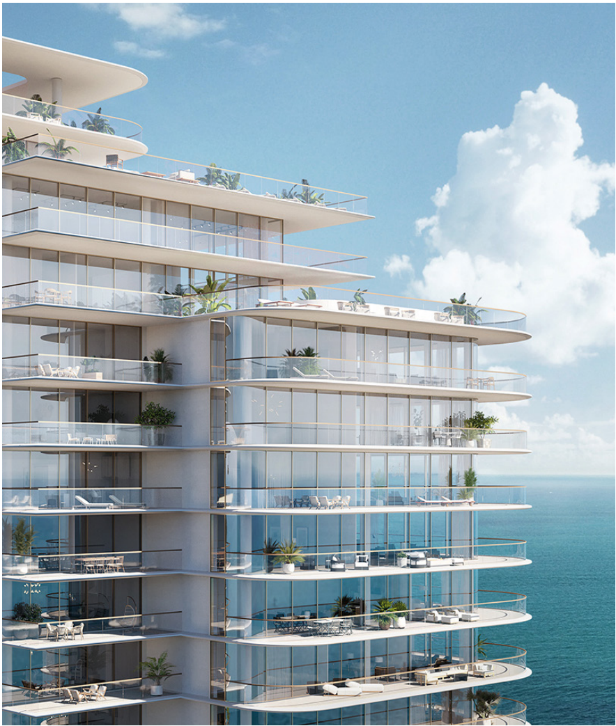
The Perigon, Miami USA