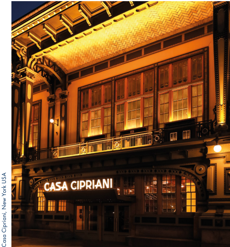
Casa Cipriani, New York USA