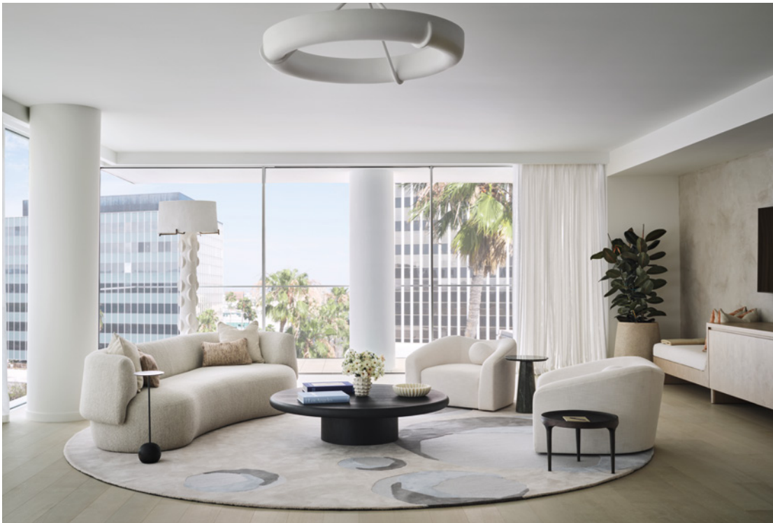
Mandarin Oriental Beverly Hills, Los Angeles USA