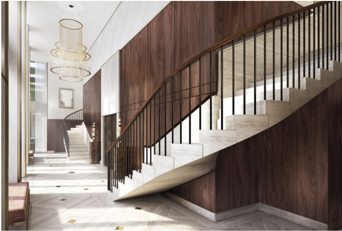
Chelsea Barracks, London England