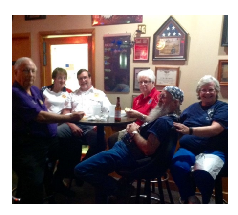
Enjoying life after the Memorial Day luncheon.

Commander. The pay is terrible but the rewards of helping your post and veterans out weights the dollars.