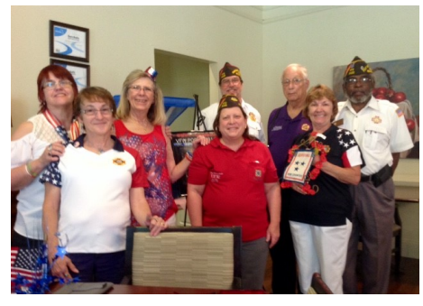
Post visit to Magnolias Nursing home on Memorial Day.