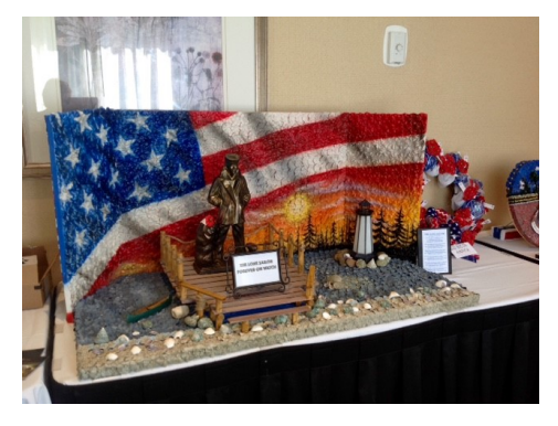
Post 3433 #1 Department Buddy Poppy's (again). On to National.