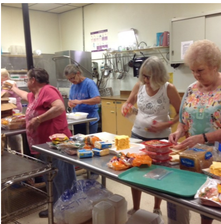
Hanging out and enjoying life