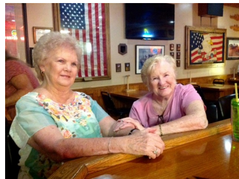
Auxiliary members at the District School of Instruction