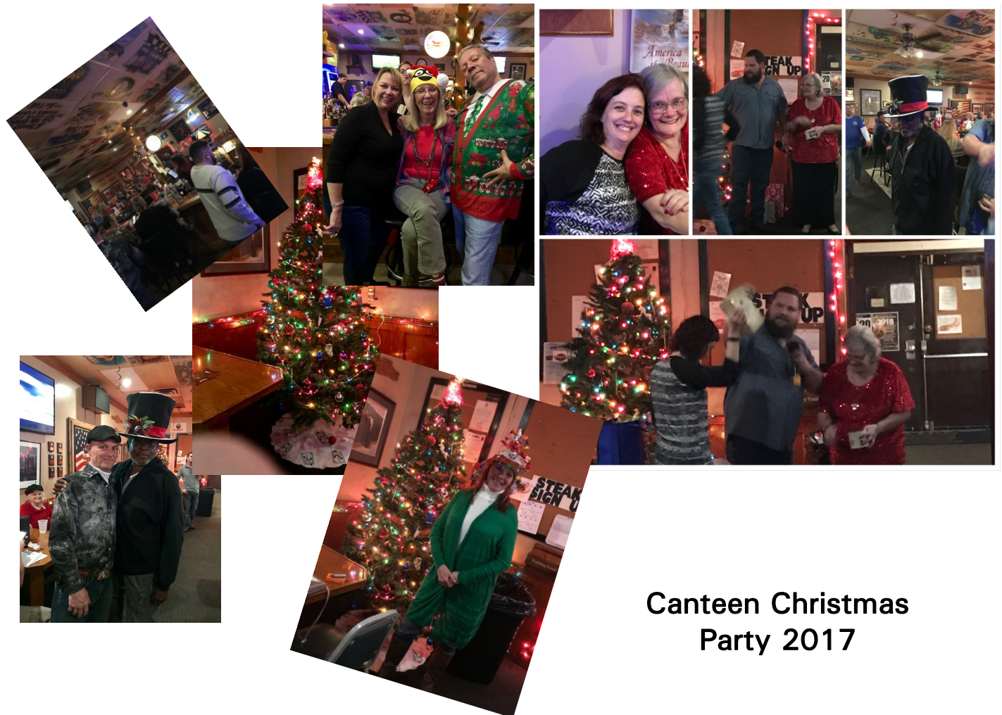
Canteen Christmas Party 2017

http://www.dpaa.mil/News-Stories/Recent-News-Stories/Article/1385453/dpaa-reaches-milestone-in-uss-oklahoma-identifications/