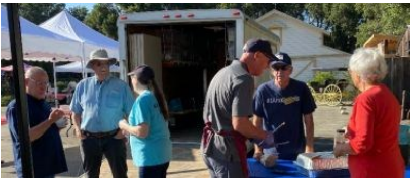
Fifteen Kiwanians helped with the cooking event