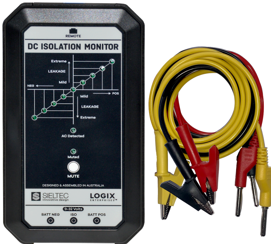
Figure 2. HIM-2 Unit with leads

If the hull has a dead short to the positive or negative battery terminal, the red LED at the extreme end of the graph will illuminate. In this case an alarm will sound to indicate a problem. The alarm can be muted by pressing the mute switch. When muted, the green mute light will illuminate. When the short is removed, the alarm will stop and the mute command will reset so if it happens again the alarm will sound.