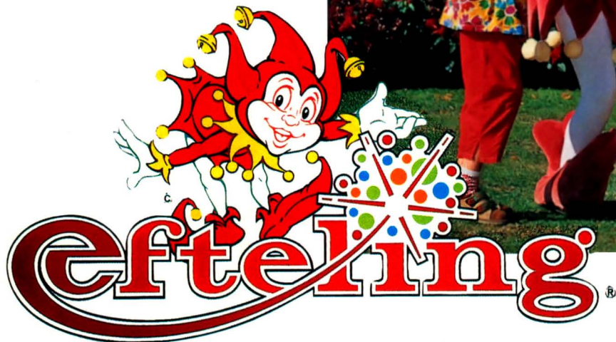
Children immediately take to the fairy tale characters at Efteling.

premier award for tourism and recreation. The award was given for the original way Efteling has succeeded in providing a continually increasing number of visitors with affordable recreation of a constant quality.