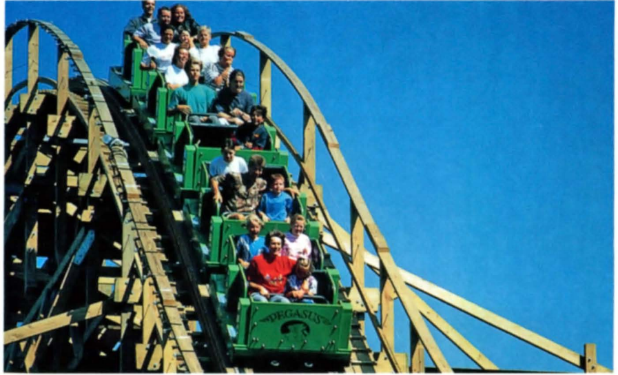
The Pegasus, built in 1991, was designed by the late Curtis Summers.

Efteling has always been the Fairy Tale Treasure Trove; it is suiting that the park chooses to further expand by looking back at where it came from and what the expectations of its visitors are. Their future plans may look reserved at first sight and most likely will not