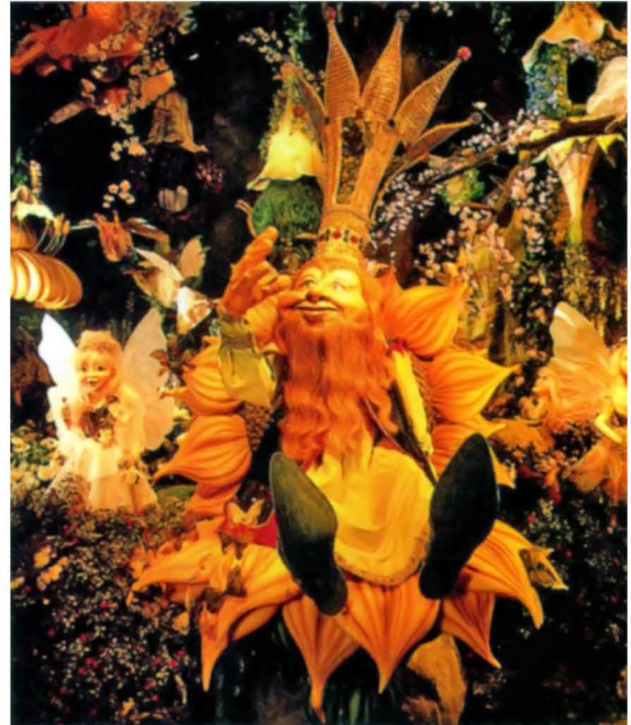
The Troll King features 26 separate animatronic functions.

In 1998 Vogel Rok ( Bird Rock ), a $13 million indoor roller coaster, opened. This latest major ride takes guests in pitch darkness through high-speed helixes and sudden drops at speeds of up to 45 mph. Vogel Rok's trains feature an on-board sound system that plays music especially created for the