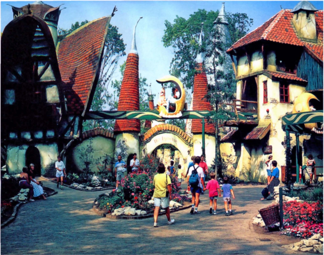
The public relations building fits well in the theme of the park.

many in the industry, with many rides making their first appearances at the Dutch theme park. For its visitors Efteling is more than a just a theme park.