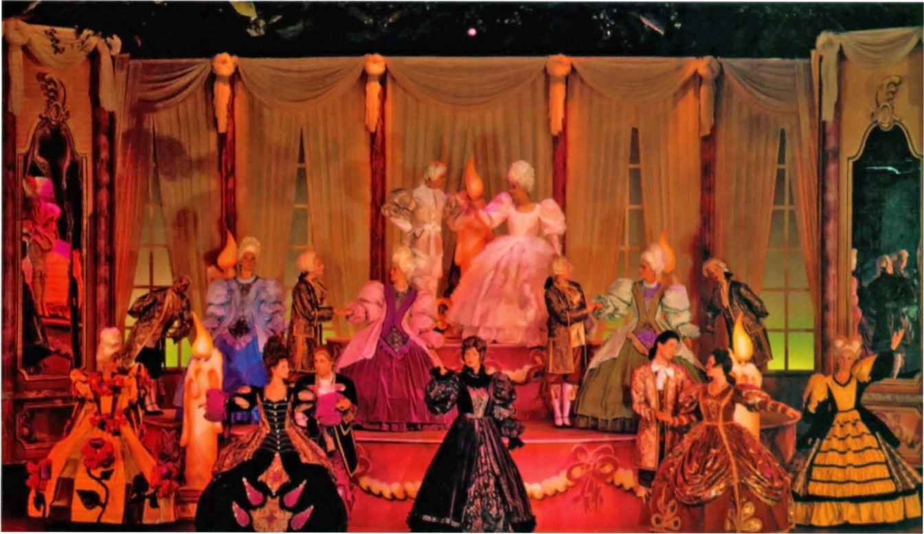
Live shows recreate traditional fairy tales.

season, and another one costing $52.18, which is limited to weekdays in the early and late season. In addition a two-day ticket is available for $29.50.