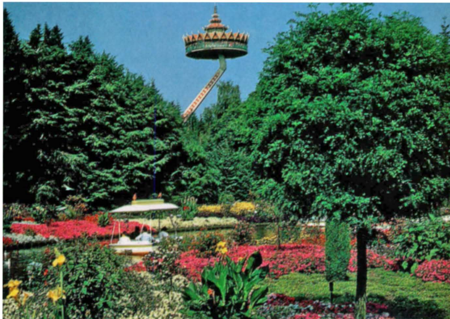
Efteling blends high and low tech attractions in a pastoral setting.

still people are looking for an “Efteling” atmosphere. “With lighting and other effects we are going to create a completely different product than the ‘summer Efteling,’” Van der Zijl says.