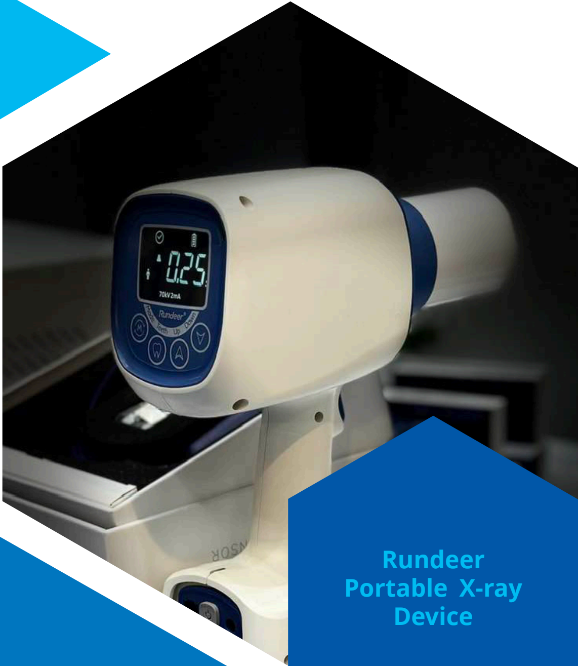
Rundeer Portable X-ray Device