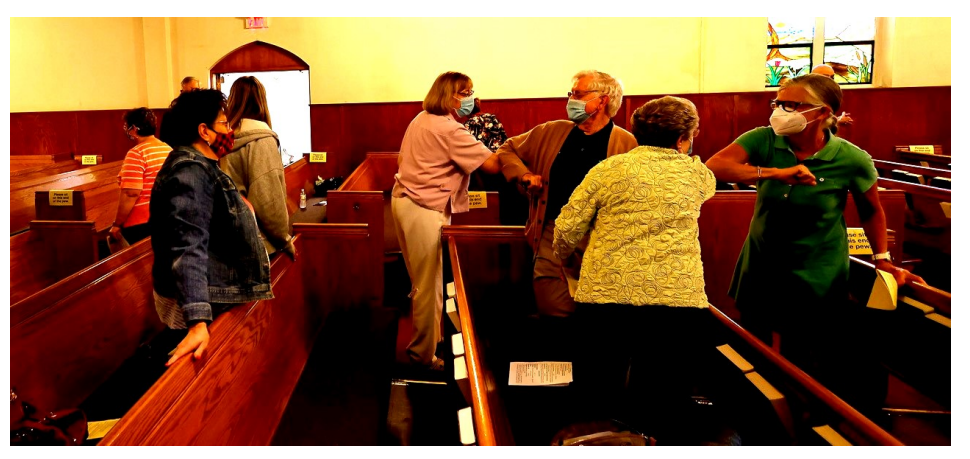
Passing the peace!