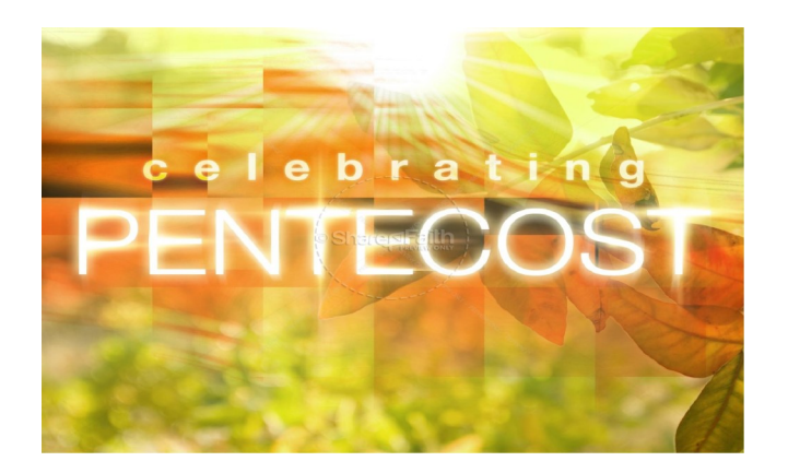
Taken from the Presbyterian Church (U.S.A.) Presbyterian Mission Website

On the Day of Pentecost we celebrate the gift of the Holy Spirit descending in a mighty rush of wind and flame to inspire the church's proclamation of Christ's rising and to empower its mission and ministry to the world. (See Acts 2:1-13; see also Joel 2:28-32.)