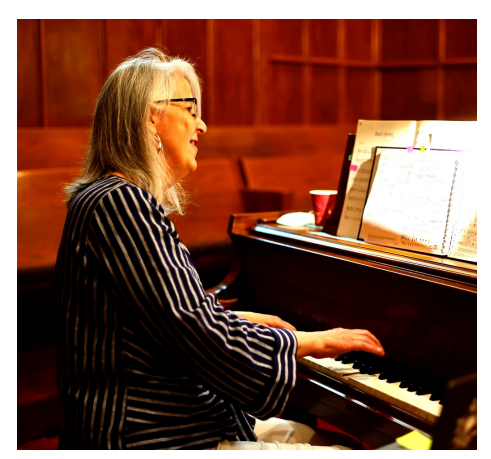
Singing God's praise!

among them and gripped them. The Holy Spirit is unseen, like the wind, which is why the Old Testament calls it ruach YHWH , "the wind, or breath, of God" (cf. John 3:8). The Spirit is the "unseenness of God" working among us.