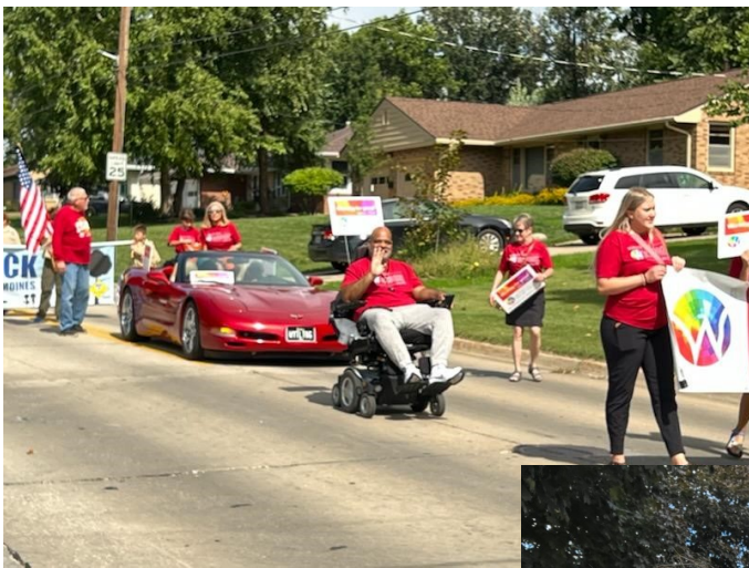
Windsor Heights Fall Festival Parade

Please send any items to me or to the church or drop off at the church. We can scan photos and get the originals back to you. I really appreciate any sharing you are willing to give for this historic anniversary.