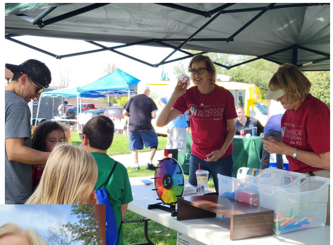
Our Table of Giveaways