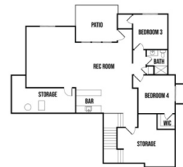
Option B: 1205 +/- sq. ft.

Renderings are for illustration purposes only and may show upgrades. The materials used on the renderings are only examples of what can be installed. Consult Builder for details.