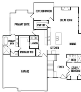
Main Level 1,833 +/- sq. ft.