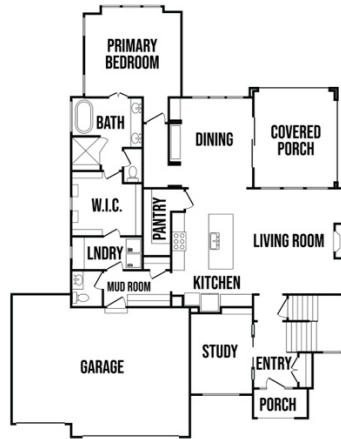
Main Level 1956 +/- sq. ft.