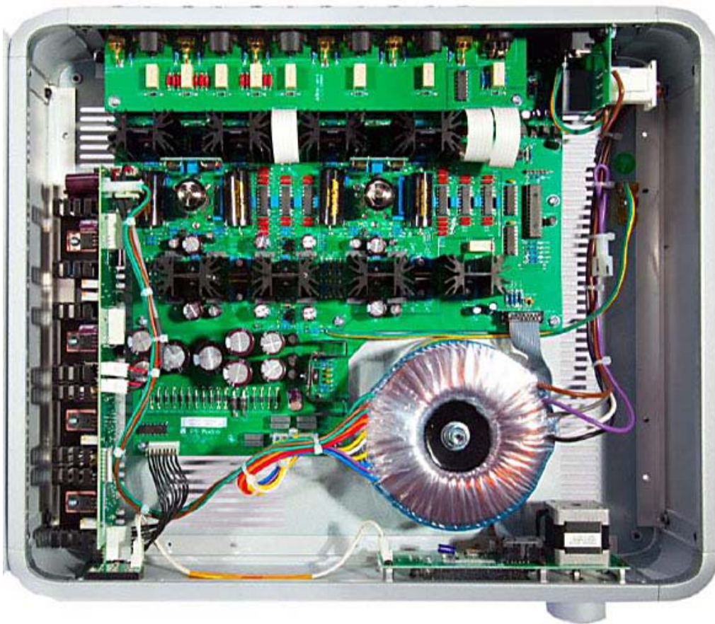
Inside the PS Audio BHK Signature Preamplifier

BAT : 3 pair of outputs (two variable/1 fixed) – Perfect for Bi-Amping ! The fixed output is for my STAX Headphone Amp