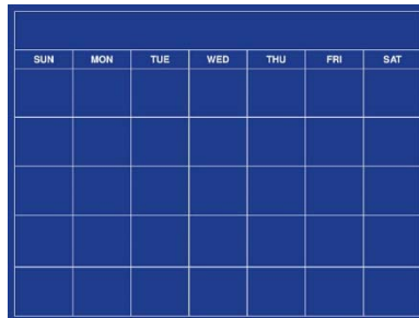
Last Month's Meeting