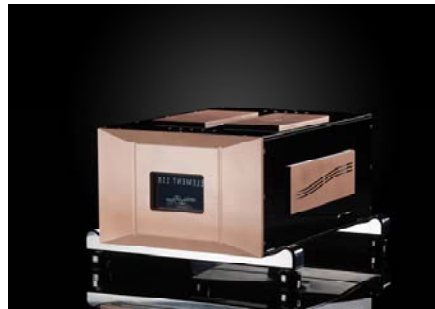
Last Month's Meeting