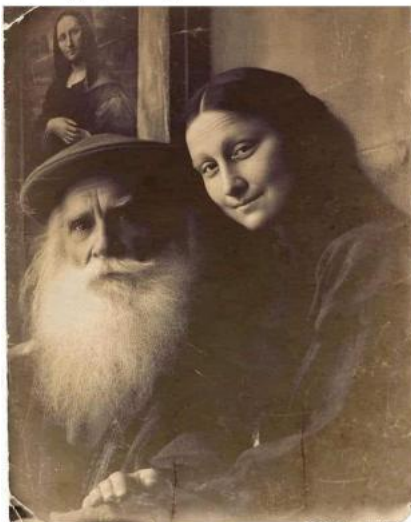
Leonardo Da Vinci And Mona Lisa 1504.