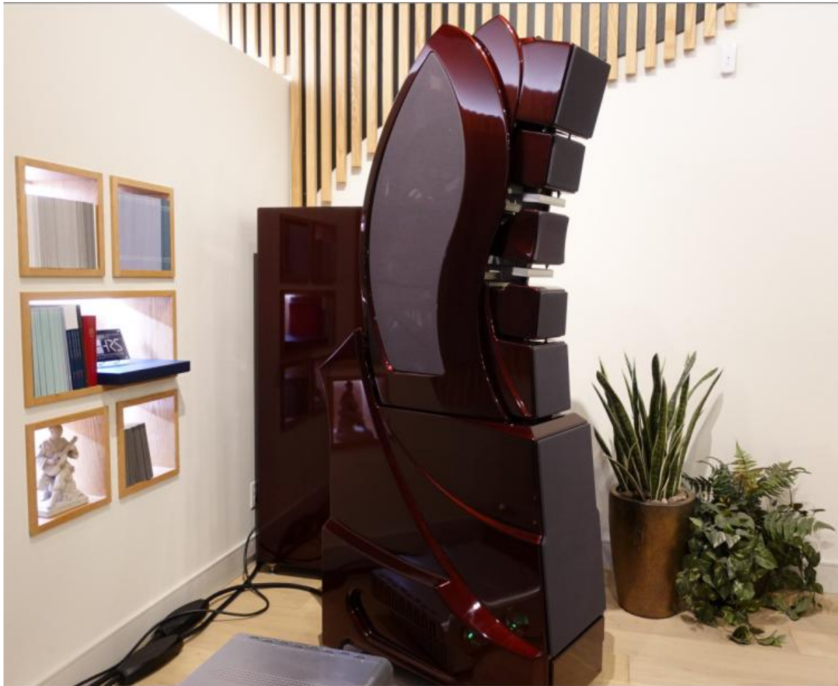
Here is a close up of the Dan D'Agostino Relentless 1600 mono block driving each WAMM.