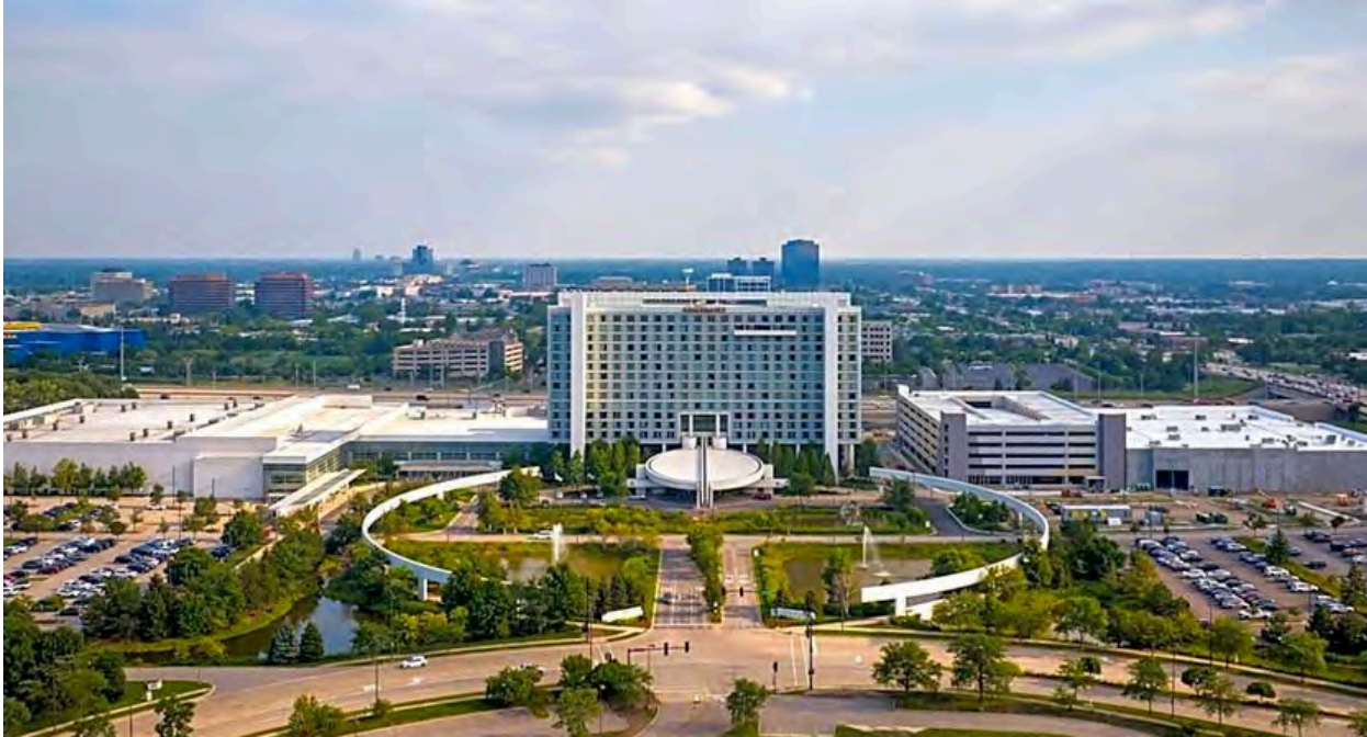
Exhibit hours were 10 am – 6 pm on Friday and Saturday, and 10 am – 4 pm on Sunday. Attendees had 22 hours to visit 235 listening rooms. That works out to less than 6 minutes per room. Obviously, it would be impossible for a single person to listen to every room.

John mentioned the best strategy was to study the Show Guide every morning and map out a game plan, floor by floor, to cover the most interesting exhibits.