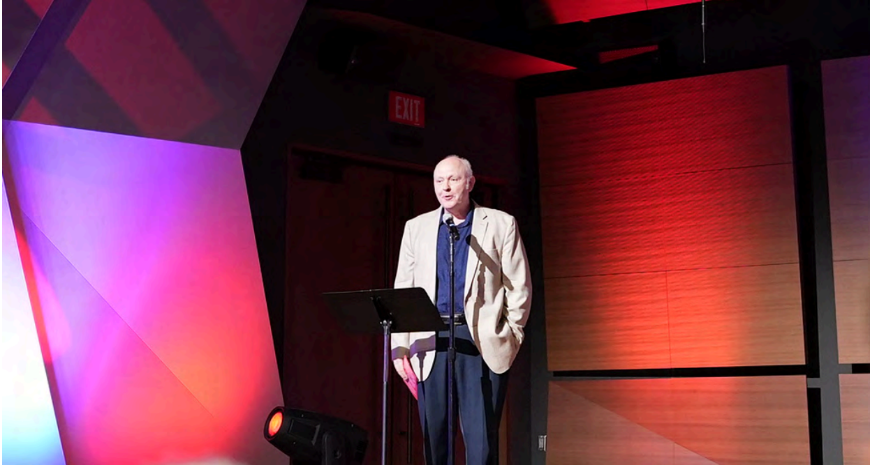
The six performers took the stage and filled the auditorium with heavenly music.