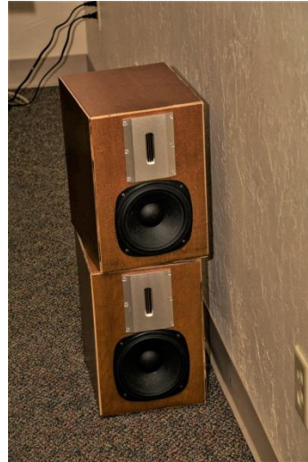
Travis Terpstra's Mini Monitor/Bookshelf Speakers. Close your eyes and these little Guys disappeared