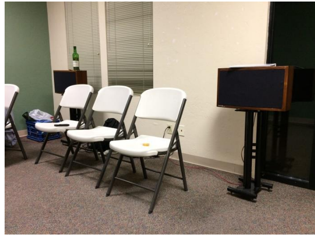
The Rare Series 2 Continentals used as Surround Channels