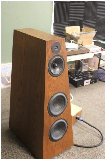
Maynard Goff's Tower's/Crossover's

While I was preparing for Saturday on Friday night installing Parts Express 5 Way Posts on three of my five 901's, others in attendance I'm sure were also doing similar prep work. The drive early Saturday morning from Phoenix into Tucson was amazing as usual.