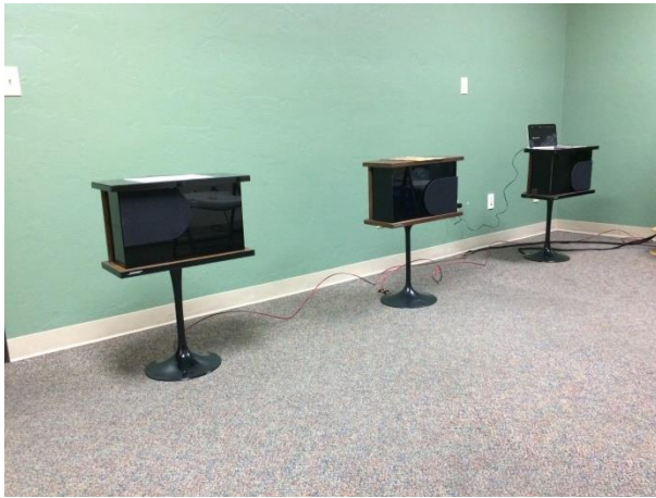
The L,C,R Series 1 and 2 Bose 901's