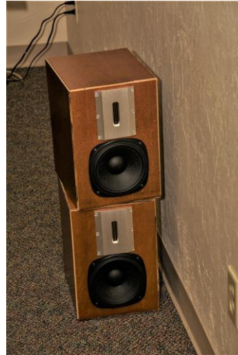
Travis Terpstra's Mini Monitor/Bookshelf Speakers. Close your eyes and these little Guys disappeared