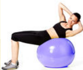
shutterstock · 82099603