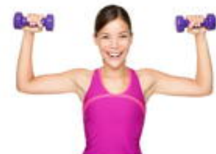
shutterstock · 94056907