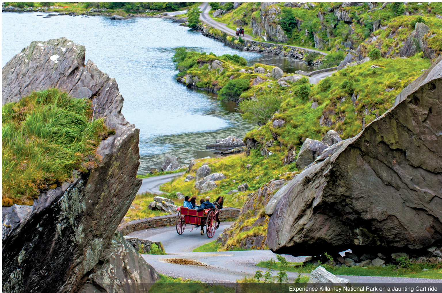
Experience Killarney National Park on a Jaunting Cart ride