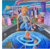
Grey (Eco)Tones Mixed media 76"x4" Rita Leduc 2023