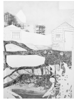
The Grey Lady (Collage) Mixed media 11"x14" (framed) Rita Leduc 2023