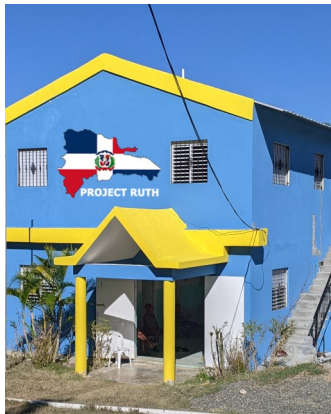
Medical Clinic, future Dental Clinic, Short-term Housing, and Medical Staff Housing

To book a vision trip, 5, 7, or 10 day mission trip please contact us for more information and scheduling. We have structured programs but remain flexible and open to making each mission trip a unique experience for you and your group.