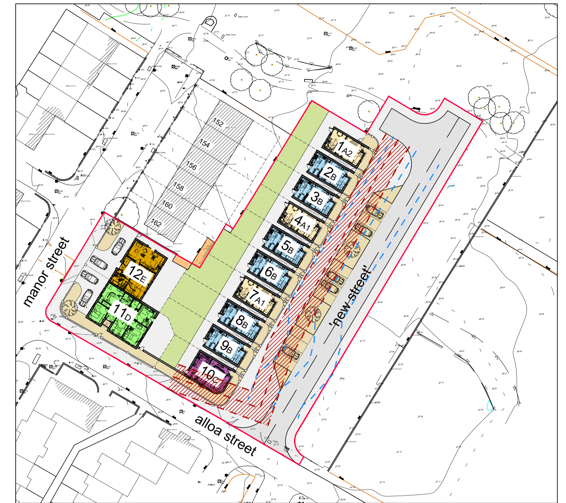
key plan (1:500)