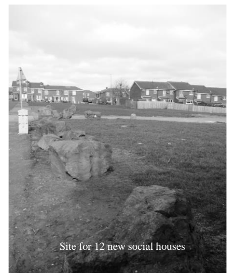
Site for 12 new social houses

When completed, all being well during the summer of 2021, the new homes will be allocated to applicants on the social housing waiting list on the basis of greatest need first.