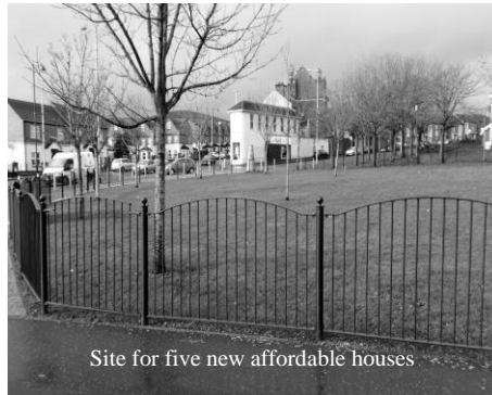
Site for five new affordable houses

A tender process during the summer of 2018 didn't result in a building contractor being appointed and there was concern that the scheme would be abandoned. Given the