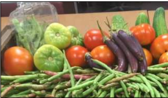
Fresh vegetables from the University of Montevallo Organic Garden

SEA's social services are provided by licensed social workers who complete assessments, develop service plans, and provide assistance to stabilize the crisis situation. The social workers are knowledgeable of local resources and often collaborate with other agencies to better serve individuals and families in our community.