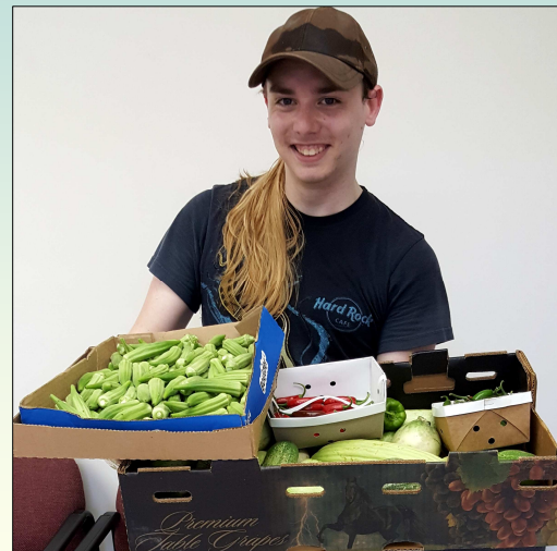
Summer Harvest student with fresh picked vegetables for clients.