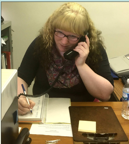
UM Falcon Scholar helping with phone duties.