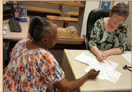
A session teaching Budgeting skills.