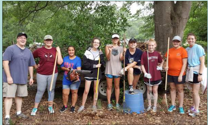
Volunteers from Living River's Mission Camp.