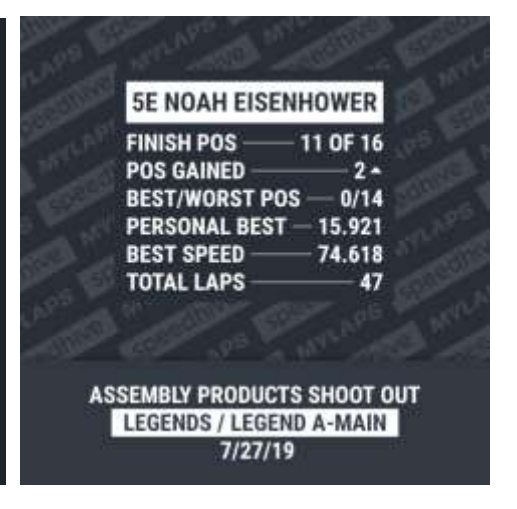
Dells Raceway 7/27/2019