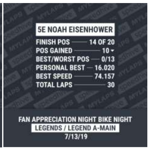
Dells Raceway 7/13/2019