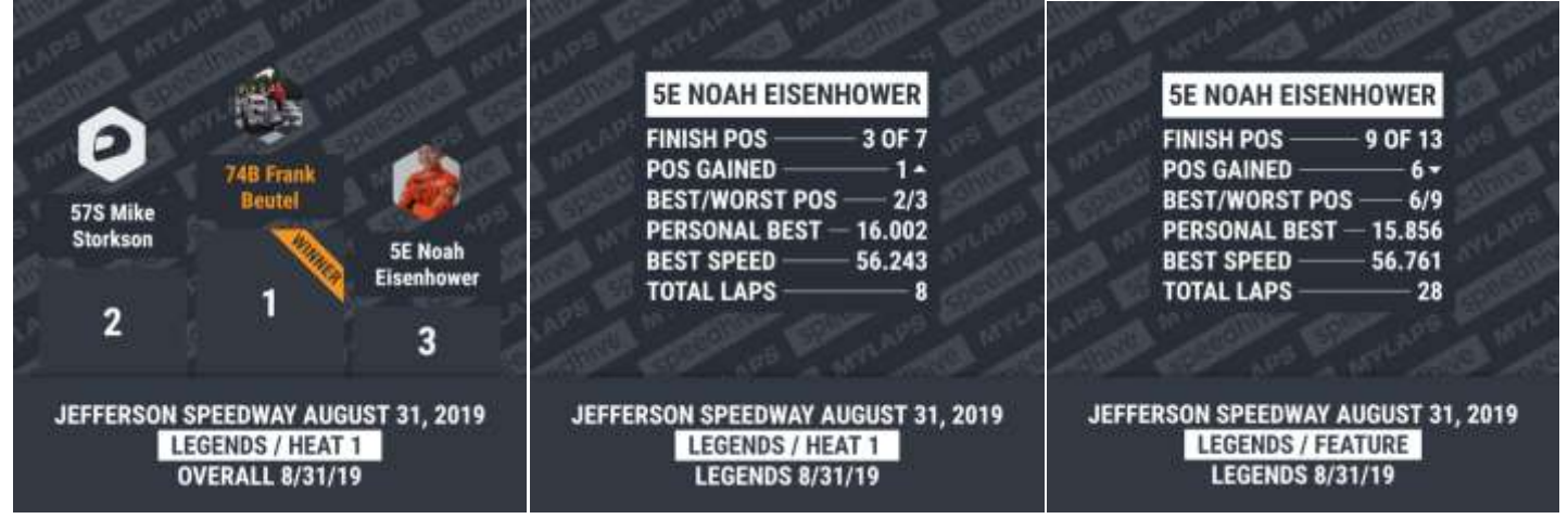
Jefferson Speedway Championship 8/31/2019