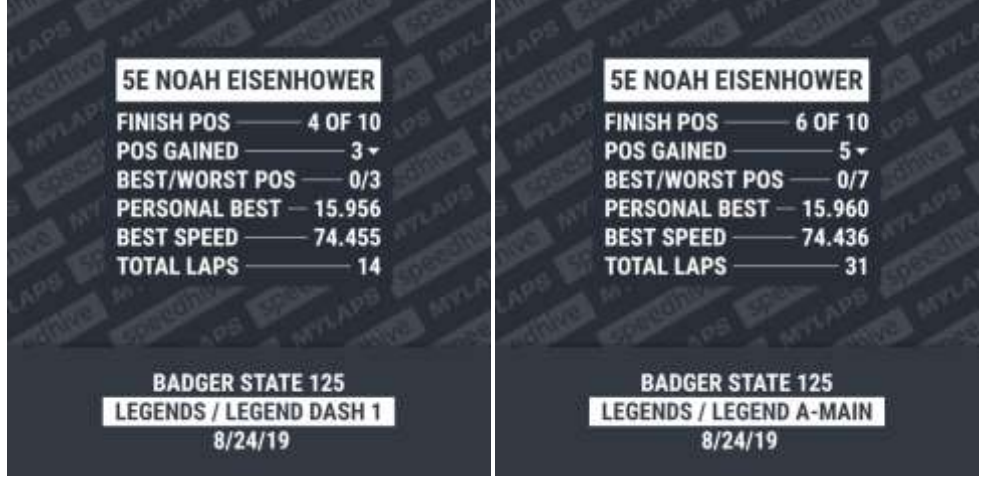
Dells Raceway 8/24/2019