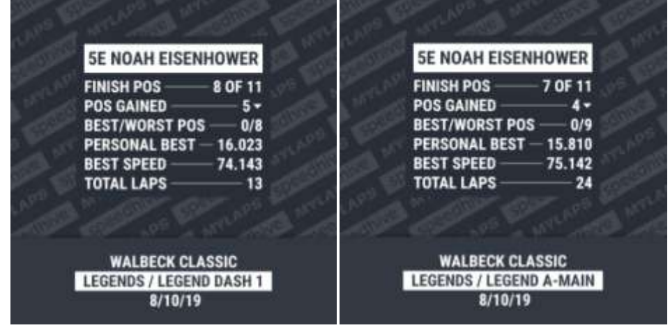
Dells Raceway 8/10/2019