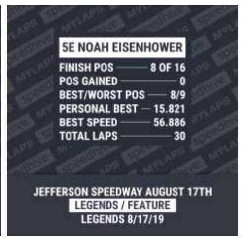
Jefferson Speedway 8/17/2019