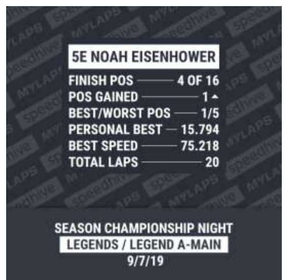
Dells Raceway Championship 9/7/2019