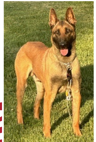
K9-AXL turns 4 June 28