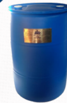
Tent Cleaner © 55 Gallon