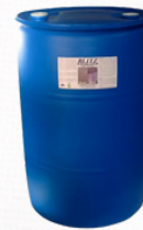
Blitz Mildew Remover 55 Gallon