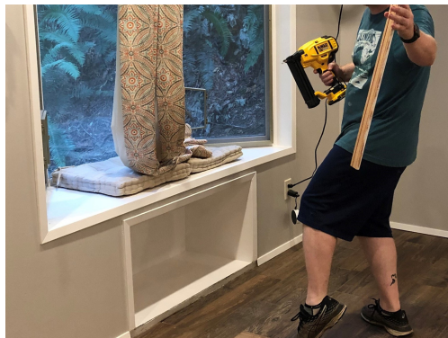
Install new baseboards

With the master bedroom floor complete, they've moved on to the next room! Check back with us soon as Steven shares successes, challenges, and recommendations for tackling your own flooring project. Can't wait to see the finished floors!