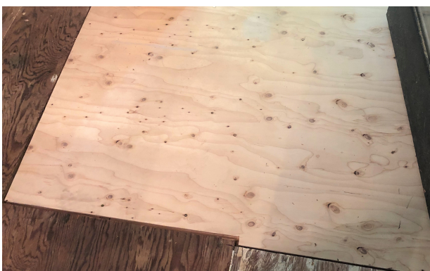
Replace rotten subflooring