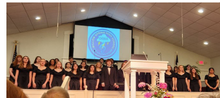
WSWS Choral Ensemble