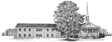
Westfield Baptist Church