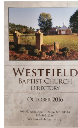
New Directory coming soon!