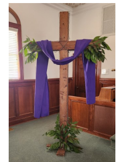
The bare cross awaits the King's sacrifice.