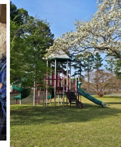
Look closely, what is missing from this picture? (children)