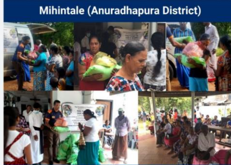
Mihintale (Anuradhapura District)