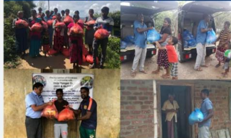
Maskeliya (Nuwara Eliya District) and Embilipitiya (Ratnapura District)