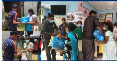
Pregnant women from Kandy (Kandy District)